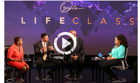
Oprah's Life Class