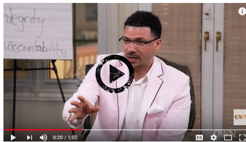
Iyanla: Fix My Life