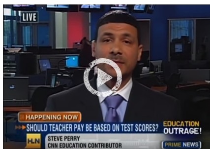
CNN - HLN LIVE