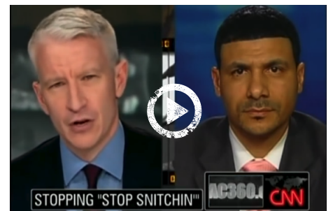
CNN - Anderson Cooper 360