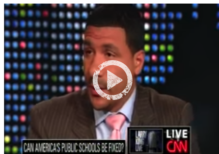
CNN - Larry King Live